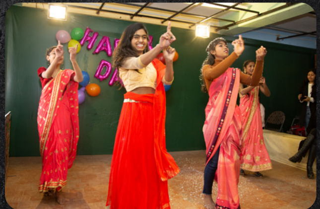
Children participating in Capacity Development monthly workshop of Hakuna Matata Program supported by different Rotary Clubs, Banks and Corporate houses under Social Corporate Responsibility