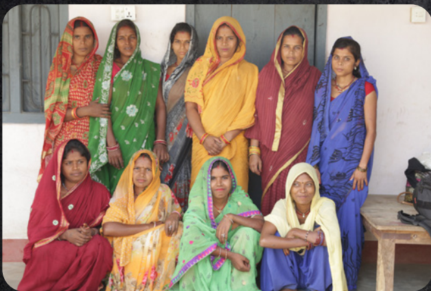
Musahar women receiving Tailoring and Mithila Art training under ONGD Fnel, Luxembourg supported project in Dhanusha. The project aims to train 24 Musahar women every six months through 2023.