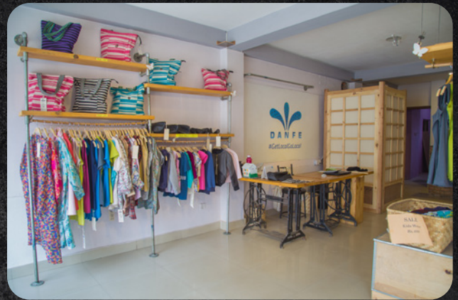
Danfe Works Enterprise Nepal (DWEN)'s outlet Danfe located in Sanepa provides a platform for beneficiaries to secure stable source of livelihood as tailors and suppliers. Pabitra Pyakhurel after completion of her training works as Tailor at Danfe Production.